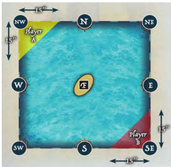
Pg. 24 in Sea of Flames book

Roll a D6, on a 1-3 the wind starts from the Southwest, on 4-6 it starts from the Northeast.