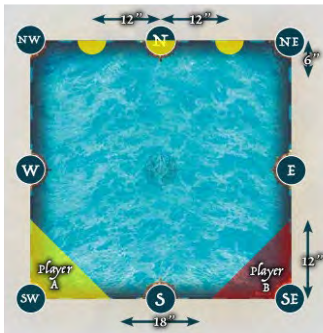
Pg. 55 in Armada Core Book

The players' deployment zones are in the diagonally opposite corners from the objectives as shown. The Wind begins the game blowing from the North.